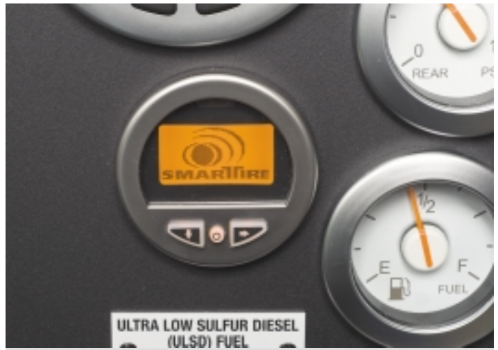
Standard equipment on the 2009 MCI J, E and D models will include the SmartWave Tire Pressure and Temperature Monitoring System that improves safety while increasing tire life. Shown here is the standard dash monitor that will be installed on MCI coaches. MCI.

optional upgrade to the Saucan GPS asset tracking system provides additional features such as vehicle-defined geo-fencing, route optimization, vehicle operational performance, and other features.