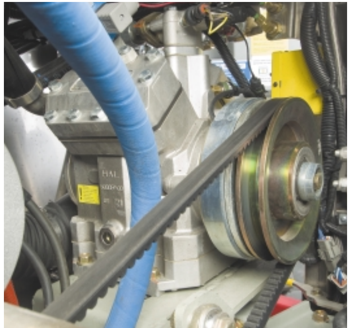
For 2009, standard equipment on the J4500, 4500 and D models will include this new light and compact MCI-branded compressor to improve air conditioning on your coach. MCI.

in the coach. It is offered as an option on the J, E, and D models. You can even upgrade your coach with the latest Internet technology. Wireless Internet is now optionally available on the J, E, and D models. You can also opt for 110-volt outlets and iPod connectivity.