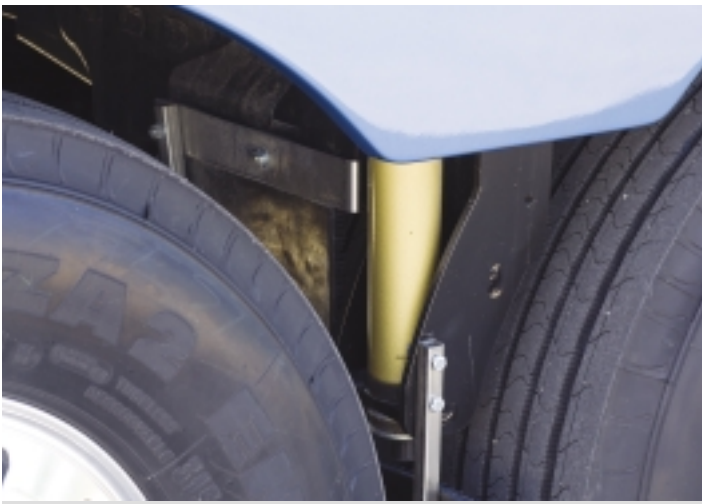
As its name implies, the success of the new wide-ride suspension lies in the engineers putting suspension components further outboard on the coach as shown here. The result is an impressive improvement in handling and a better ride for the passengers. MCI.