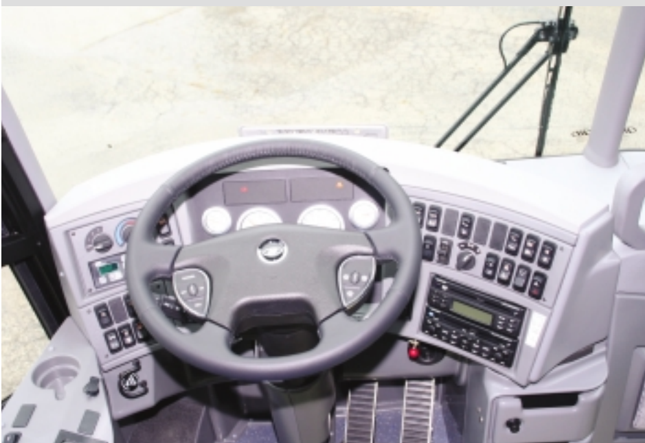
Both the J4500 and E4500 for 2009 will feature a new steering wheel. Controls built into the steering wheel will include cruise control. Another improvement is the elimination of the traditional knife-type battery disconnect switch and its replacement with a driver-actuated dash switch. NBT.

Looking for more entertainment options for your passengers? MCI offers satellite radio and TV as an option on J, E, and D models in 2009. If your coaches are used for tours, you may also be interested in the new cordless microphone that allows tour guides to move up and down the aisle and communicate with passengers from anywhere