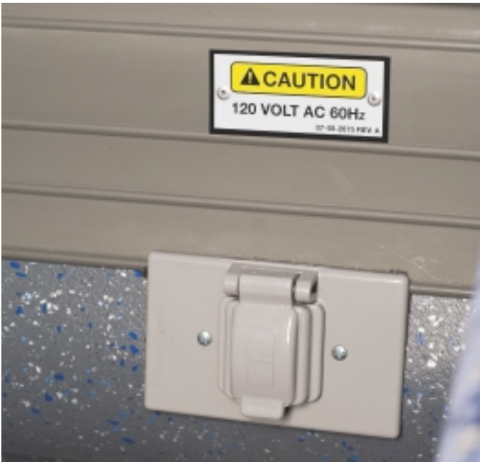
New features for passengers include optional wireless Internet, iPod connectivity and these 120-volt outlets at the seats that permit passengers to plug in their laptops. MCI.